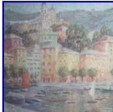
Santa Margherita