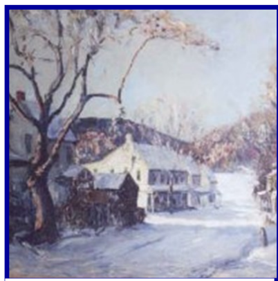
Winter's First Snowstorm by Walter Emerson Baum